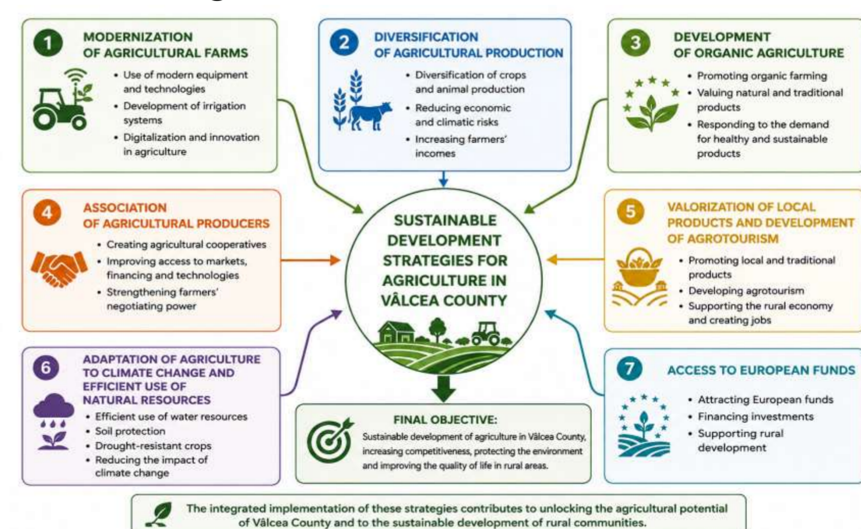
Figure 3. Sustainable development strategies for agriculture in Vâlcea County

Based on the results obtained from the analysis of the plant and livestock sector, a series of strategies aimed at the sustainable development of agriculture in Vâlcea County were formulated, presented in the diagram below.